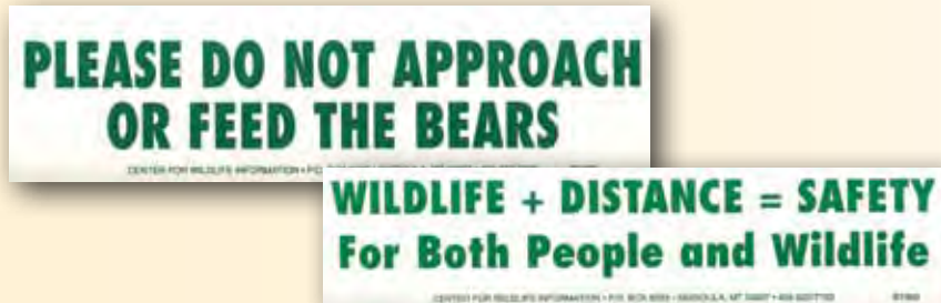
3x11 Bumper Stickers

Photographs by Chuck Bartlebaugh - Layout by Jackson Goodell - Text Development by Carolyn Hartsell