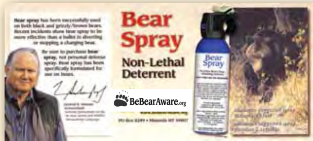
4x9 Bear Spray ED Card