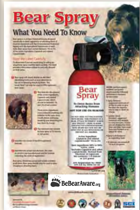
11x17 Bear Spray Poster