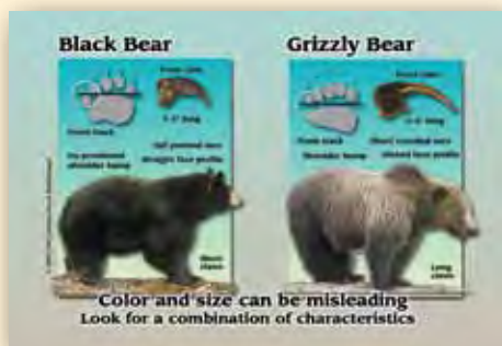
4x6 Bear ID Card