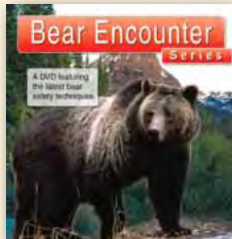
Bear Encounters DVD