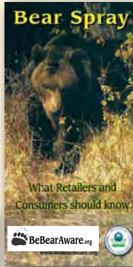
Bear Spray Brochure

Our bear spray educational material is provided at no charge so youth group leaders, hunter education instructors, hunting groups and tour operators can inform their staff, clients or partners about bear spray and how to identify, carry and use bear spray. The better informed you are about bear spray the better protected you will be when using it.