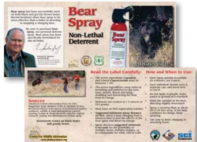
Educational Card 4x9