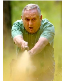
Deploying bear spray against a highly agitated, charging bear