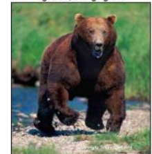
Learn the four scenarios in which an agitated bear might charge and how to stop its charge. This guide is based on the University of Montana's study and development on the use of bear spray. The study showed the importance of a spray distance of 30 or more feet and spray duration of 7 or more seconds.